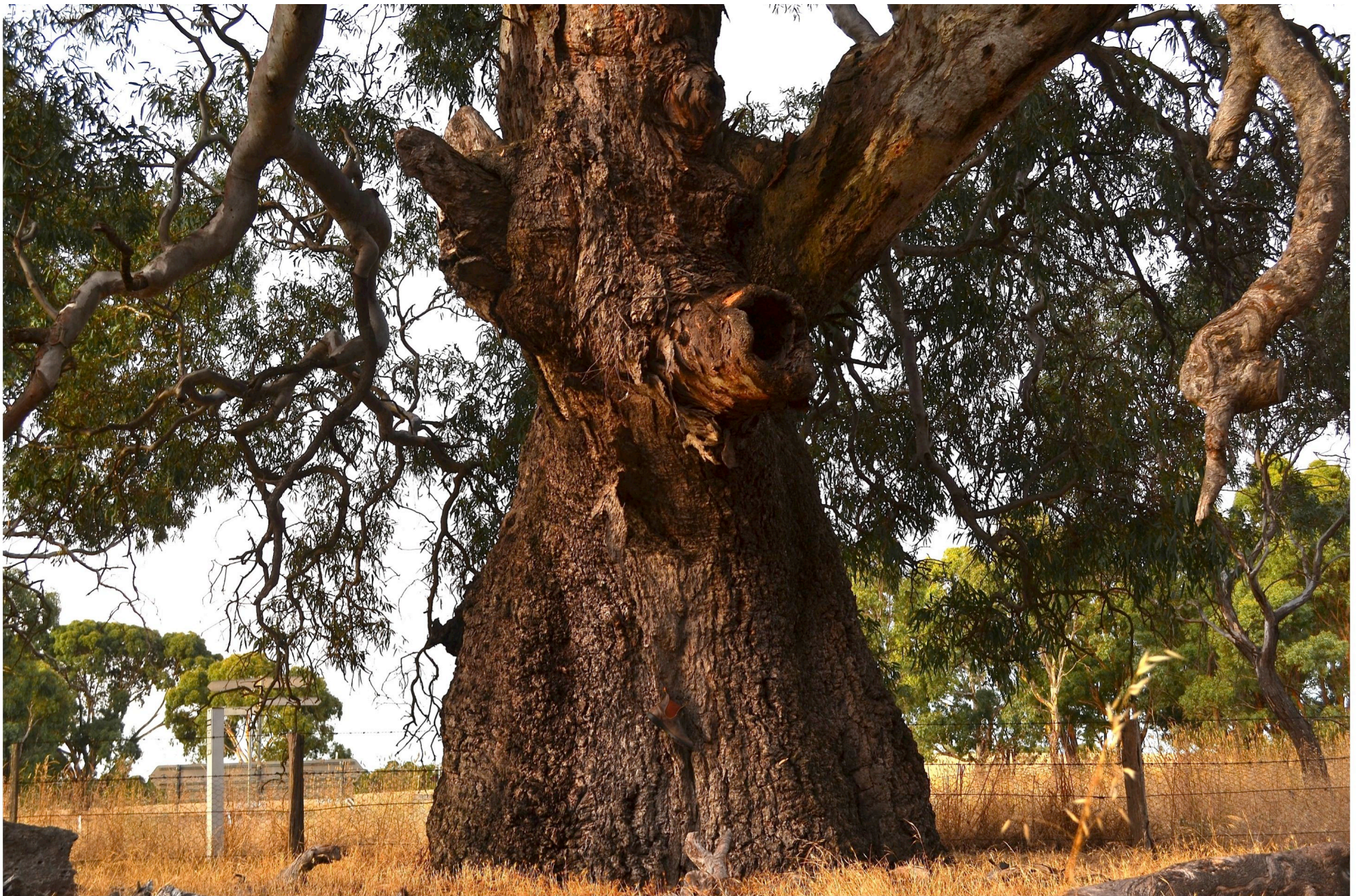
Extremely old Large Tree that could be protected with slim design specifications on the remainder of the Option 1 route west of Mt Langi Ghiran. This tree may have extra significance as a Birthing tree.