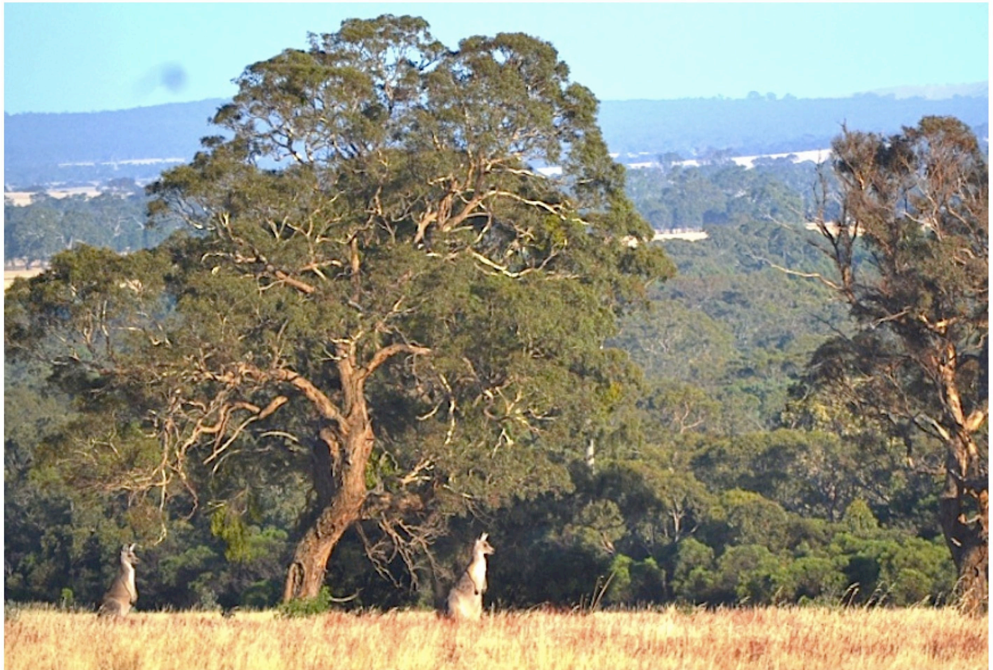
Scattered Large Yellow Box trees in the path of Option 1