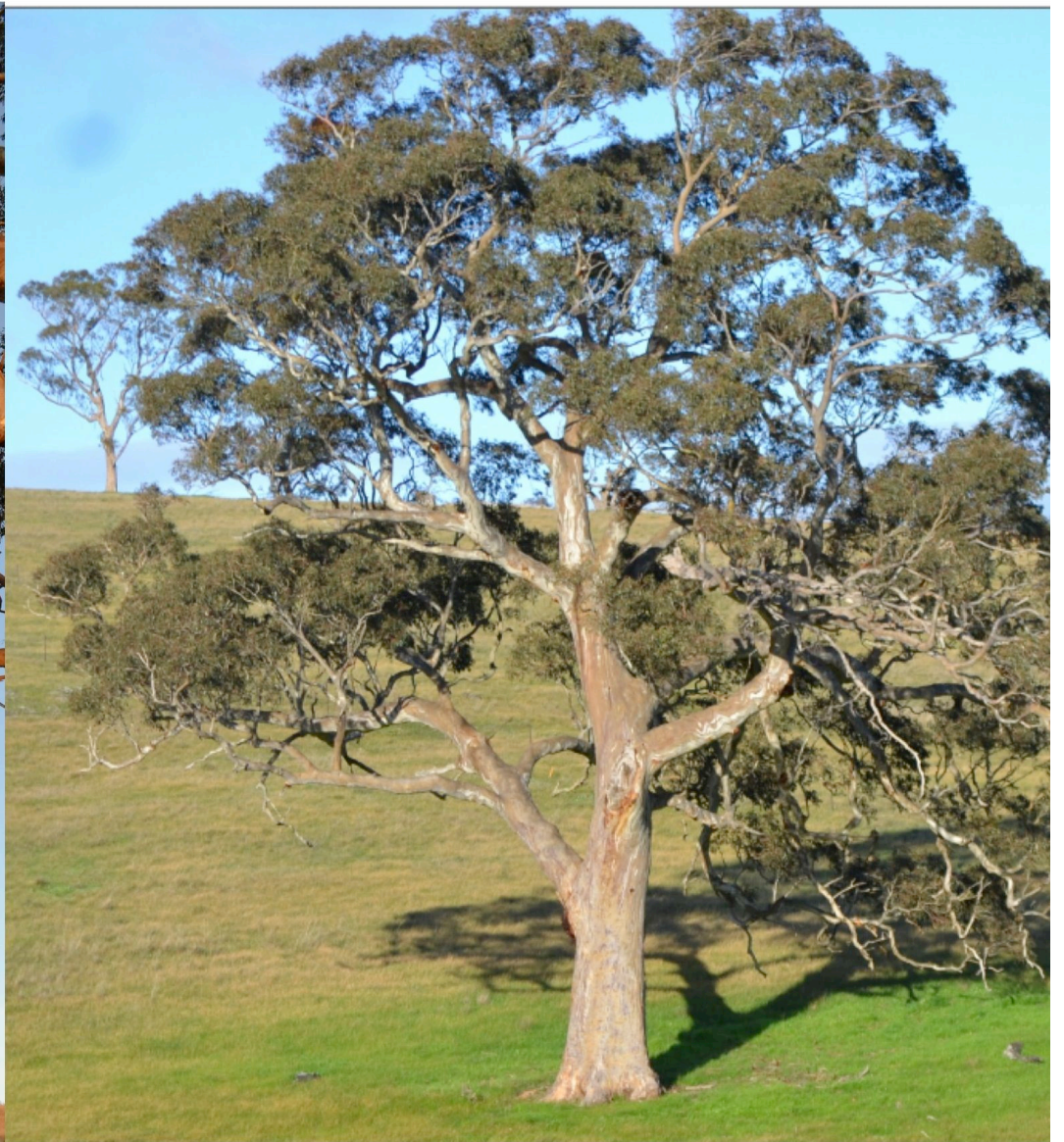
Second largest Yellow Gum in Victoria, in the path of the Option 1 deviation. The tree is registered as a significant tree with the National Trust. A black glove on the trunk (left) gives scale.