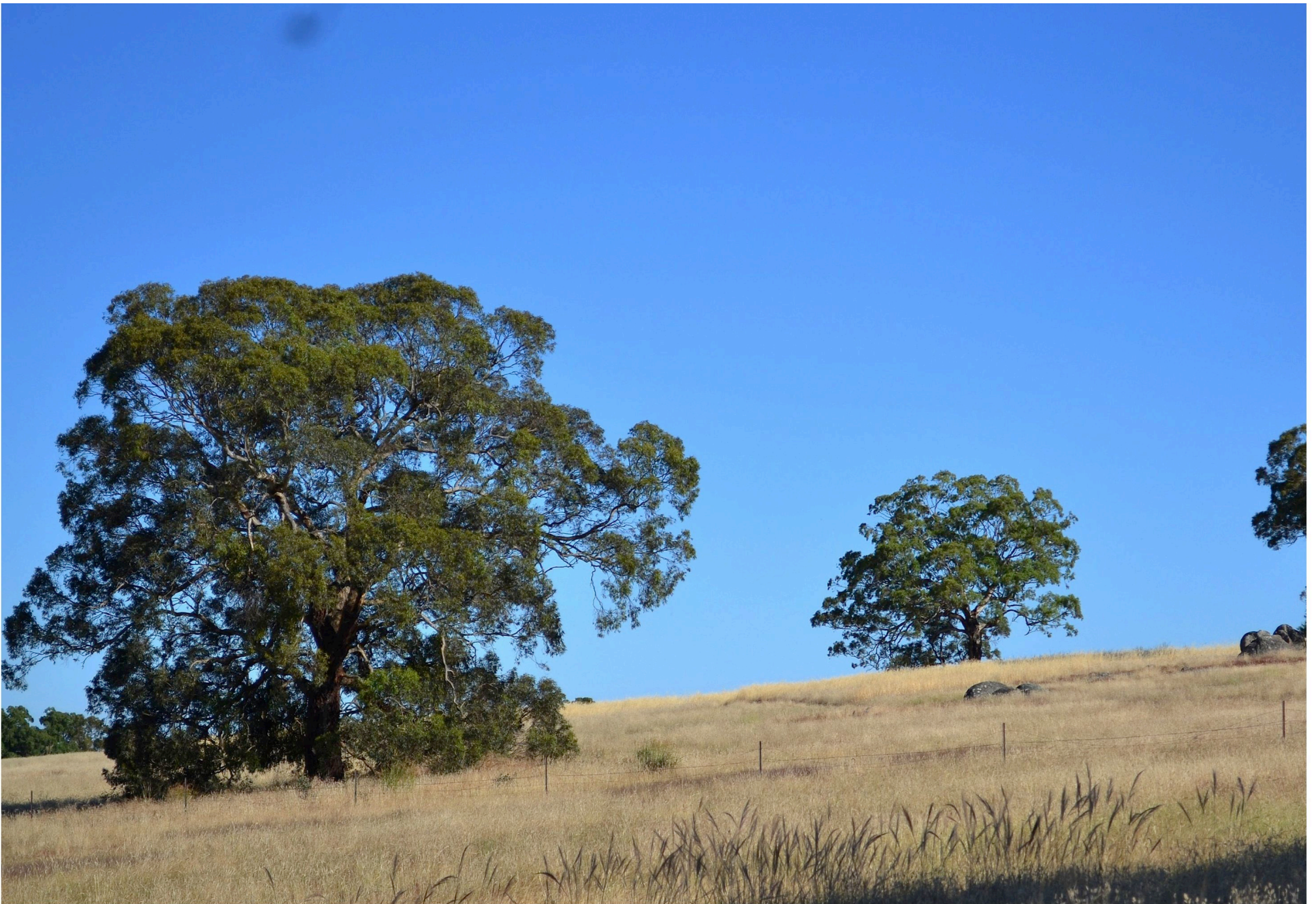
Scattered Yellow Box trees in the path of Option 1.