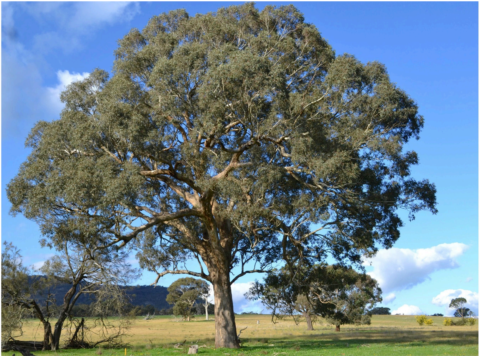
Large Yellow Box in the path of the Option 1 deviation. Note yellow peg left of trunk.