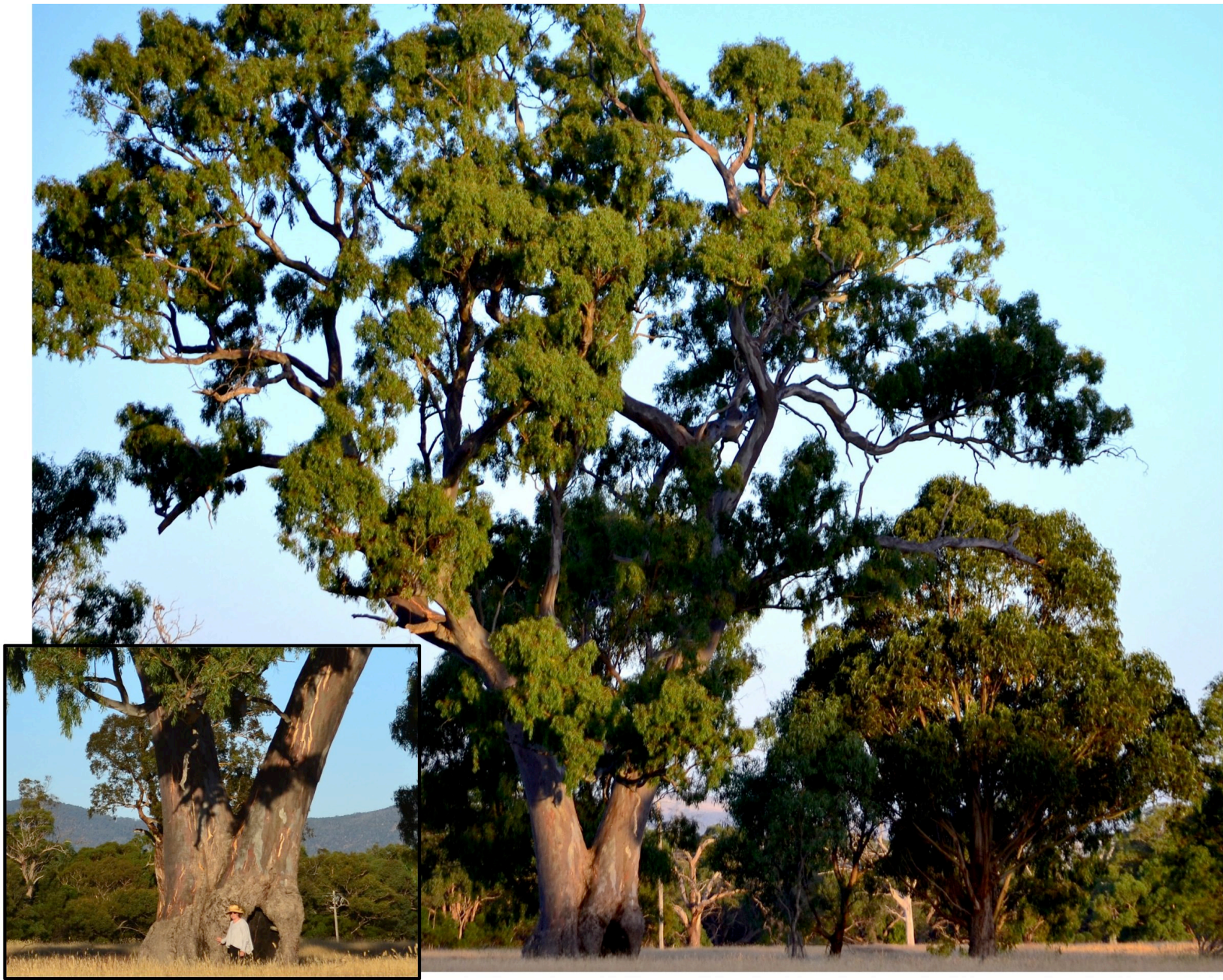
Very Large Old tree in the path of Option 1. This tree has also been classed as a Birthing tree by 2 independent Archeologists in the last 2 months. The tree is registered with the national Trust as a significant tree. Breast height Circumference is 7.4 metres.